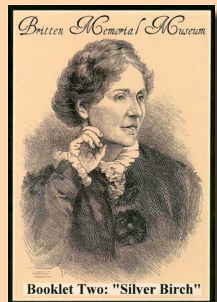
The cover of the new Britten Memorial Museum booklet.